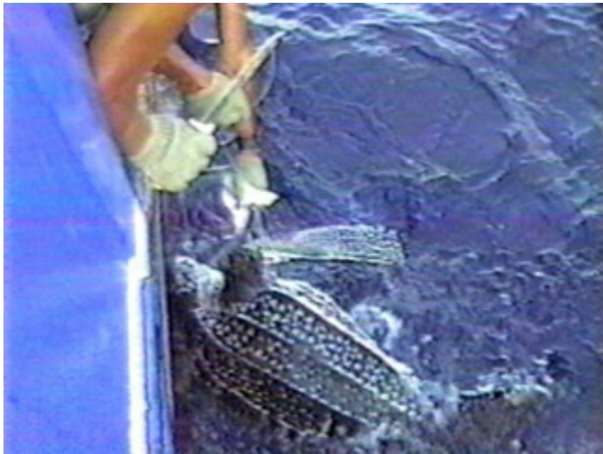
Figure 4. A leatherback sea turtle entangled in longline fishing gear.

The Pacific leatherback population has declined to such low numbers and relies on so few remaining viable nesting areas that the population's ability to respond to additional mortality is severely limited. 110 Even seemingly small mortality numbers from incidental catch can take their toll on already small populations. 111 With fishing pressure increasing throughout the Pacific, the cumulative effects of indiscriminate fisheries may be devastating to the leatherback population. 112