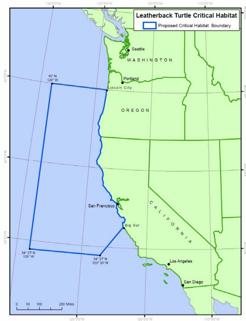
Figure 5. Proposed Critical Habitat

The proposed critical habitat area meets the ESA criteria for designation as critical habitat because it contains physical and biological features that are essential to the conservation of the species and which may require special management considerations or protection. 236