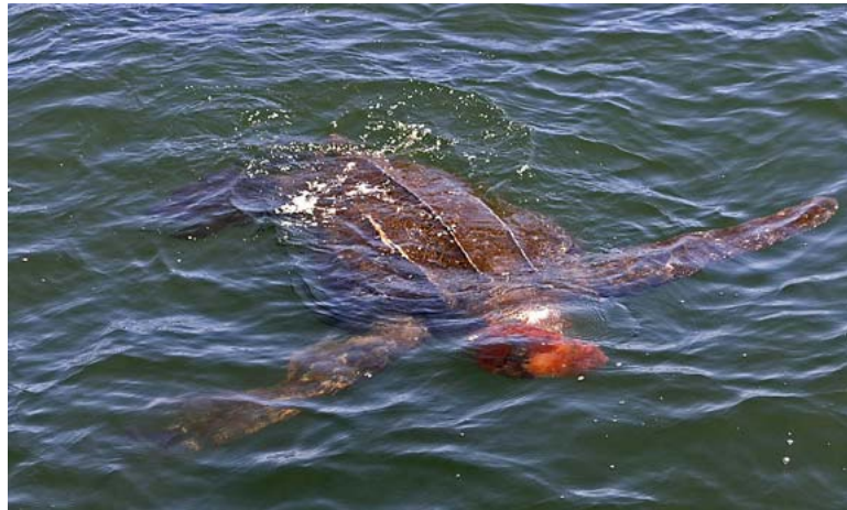
Figure 1. Leatherback feeding on a jellyfish in Proposed Critical Habitat Area.

Recent studies show a positive relationship between leatherback abundance in neritic waters off California and the average annual Northern Oscillation Index (NOI). 64 Years of positive NOI values appear to correspond with oceanographic processes advantageous to zooplankton production, such as upwelling and subsequent relaxation. 65